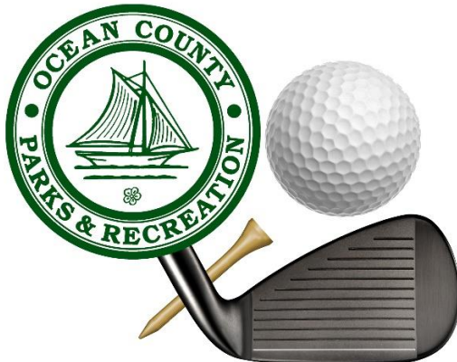
Ocean County Golf Course at Atlantis